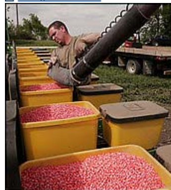
Seed corn is loaded near Rochelle, Ill. More U.S. acres are expected to be planted with corn this year to help produce more ethanol.